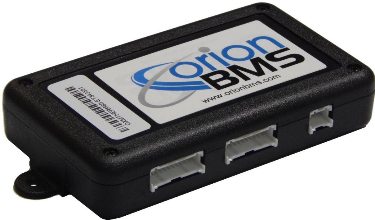
Thermistor Expansion Module (p/n: OXMTEM80) pictured

The thermistor expansion module is used in applications where more than the 3 standard thermistors are needed for temperature monitoring. One thermal expansion module monitors up to 80 thermistors. The unit communicates with the Orion Jr. 2 BMS system via CANBUS or via two 5V analog signals (emulated thermistors). The thermal expansion module is programmable and can be setup for the exact number of thermistors the application requires. A software utility allows for viewing the value of each individual thermistor so that thermistor errors can easily be located.