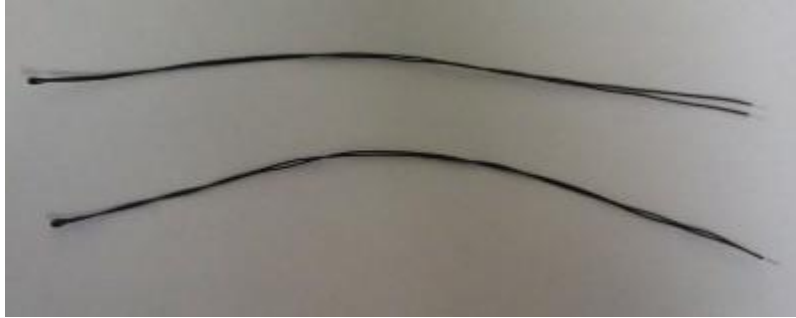
200cm length thermistors pictured

The Orion Jr. 2 main unit supports 3 thermistors. If more than 3 thermistors are needed, additional thermistors can be connected to the Orion Jr. 2 unit using the Thermistor Expansion Module (sold separately).