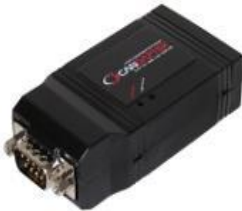
CANBUS to USB adapter (CANdapter)

The CANdapter is a low cost CAN to USB adapter used to monitor CAN traffic for diagnostic purposes and can be used to upload and download configuration settings. The Orion Jr. unit does not require the CANdapter for programming [the RS232 interface can be used instead], but it may be a useful support tool for CAN enabled units. All programming and diagnostics for the Orion Jr. unit are performed using the RS-232 interface on the BMS.