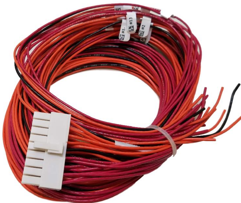
16 Cell Voltage Tap Harness - p/n CWHJ2166 pictured.

The cell voltage tap wiring harness is what connects the battery cells to the BMS. It comes standard as a 6 foot (1.8 meter) length and is terminated in cut wire without any terminals. The wires are 22 AWG stranded and appropriate crimps should be used with them. Each wire on the wiring harness is numbered to simplify installation.