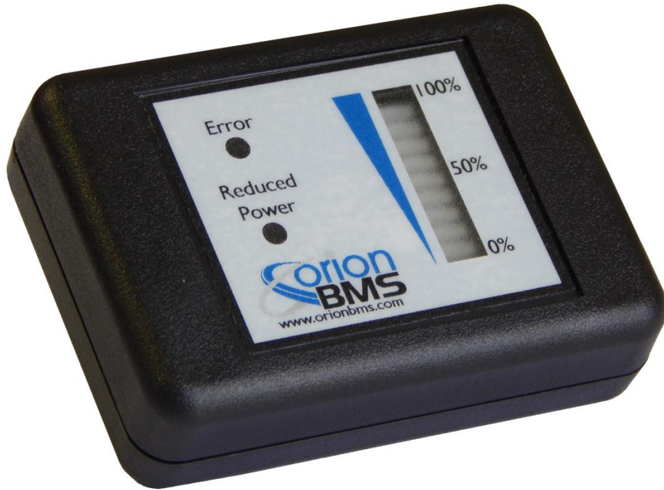
Basic Display Module (p/n: OXMBD48) pictured

The Basic Display module for the Orion Jr. BMS provides visual feedback of the essential information on a battery pack. This information includes State of Charge, Power Limited (reduced output power), and the Malfunction Indicator Status (error indicator).