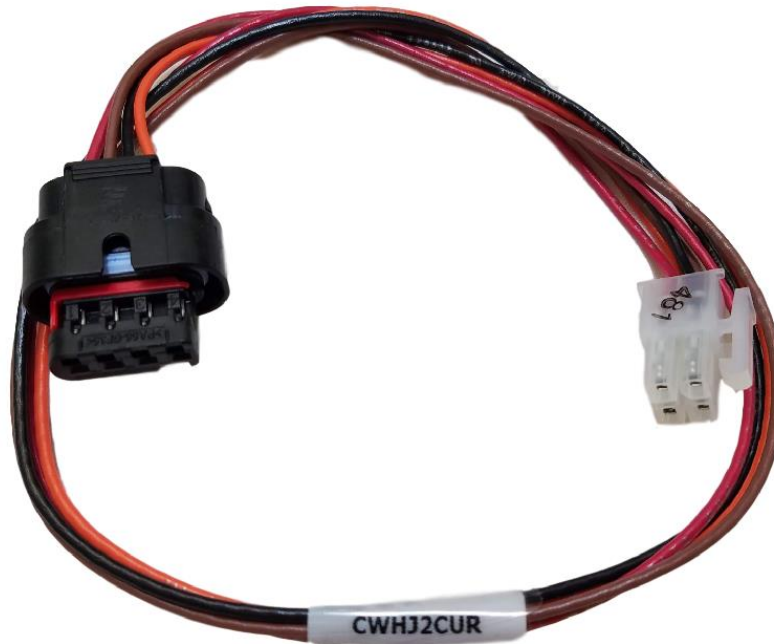
Current Sensor Harness - p/n CWHJ2CUR pictured

The current sensor wiring harness is what connects the hall effect current sensor to the BMS via 4 wires. The harness is approximately 18 inches long and comes with the correct mating connectors already installed on both ends.